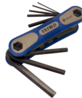
Hex Keys Folder 8 Pcs 1.5-8 mm 46-8-F