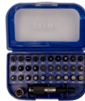
1/4" Bit Set with Adapter, Socket, Bit Holder 475-32-1